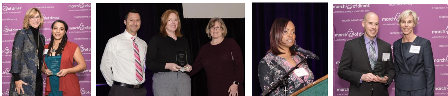
Imaaes from the 2017 Washinaton Nurse of the Year event.

Canidadttes are nominated by peers, managers, supervisors or even the families they have impacted. Each nomination is carefully reviewed and scored by a committee of [name] and other leaders from the community.